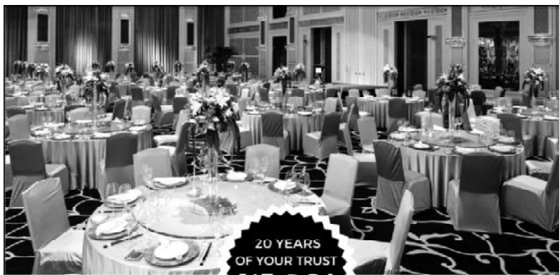
TSG GRAND HOTEL, DOLLYGUNJ

Sd./- (Seal & Sign) Sudarsan Biswas Advocate District & Sessions Court Building Port Blair